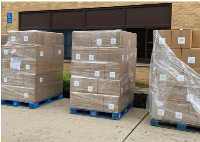
Backpacks and supplies delivered