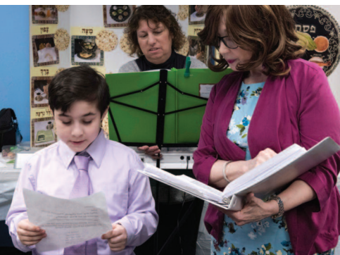
Musical program in action.