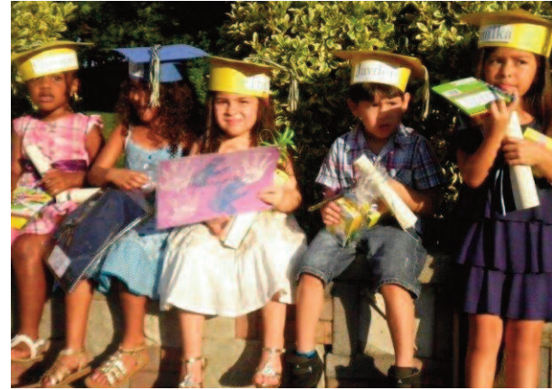
Graduates proudly received their certificates.

The joyful occasion was capped with a light barbecue and an exciting raffle drawing of many impressive gift baskets.