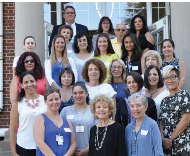
Volunteers and staff attended the opening breakfast.