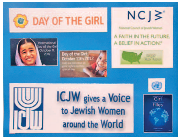
Hewlett High School students advocate for girls