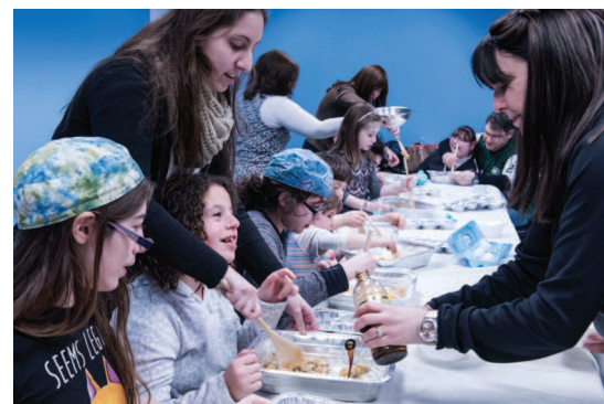
Children enjoying the SULAM-LI activities.

Meeting on Sunday mornings, at the Oceanside JCC, the SULAM-LI staff transmits the beauty of our Jewish heritage using a wide range of instructional techniques and curriculum methods. Music, cooking, crafts and computers all round out the educational experience. Class sizes are small and all learning is carried out in small groups or individually, allowing students to maximize their potential. Students and their families also participate