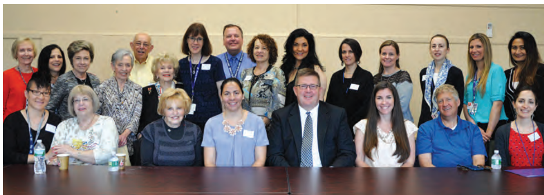
Participants at the ENL closing breakfast.