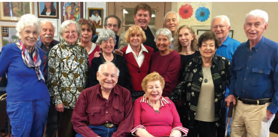
Attendees enjoying the program.